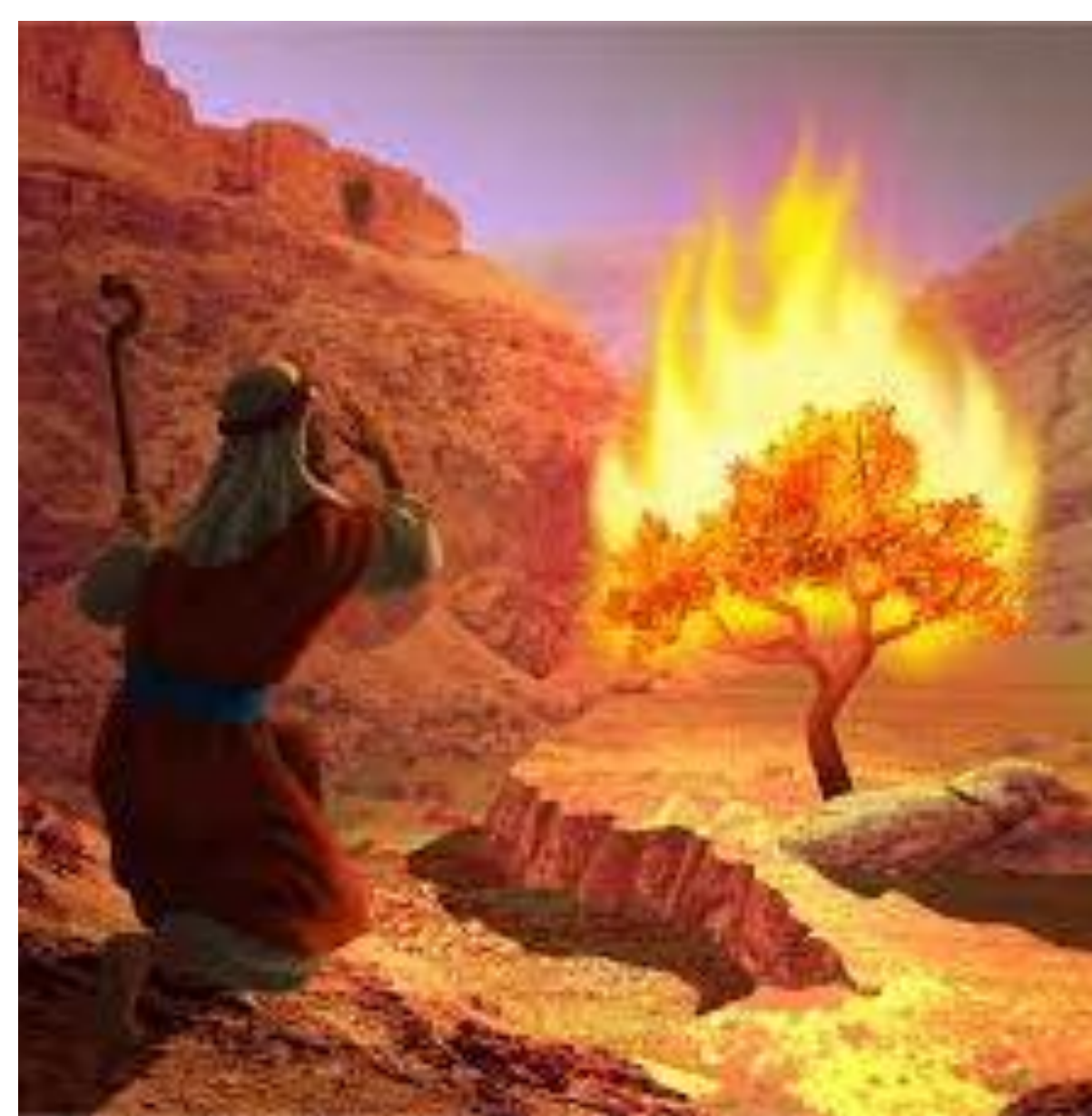
God's Presence Represented By Fire