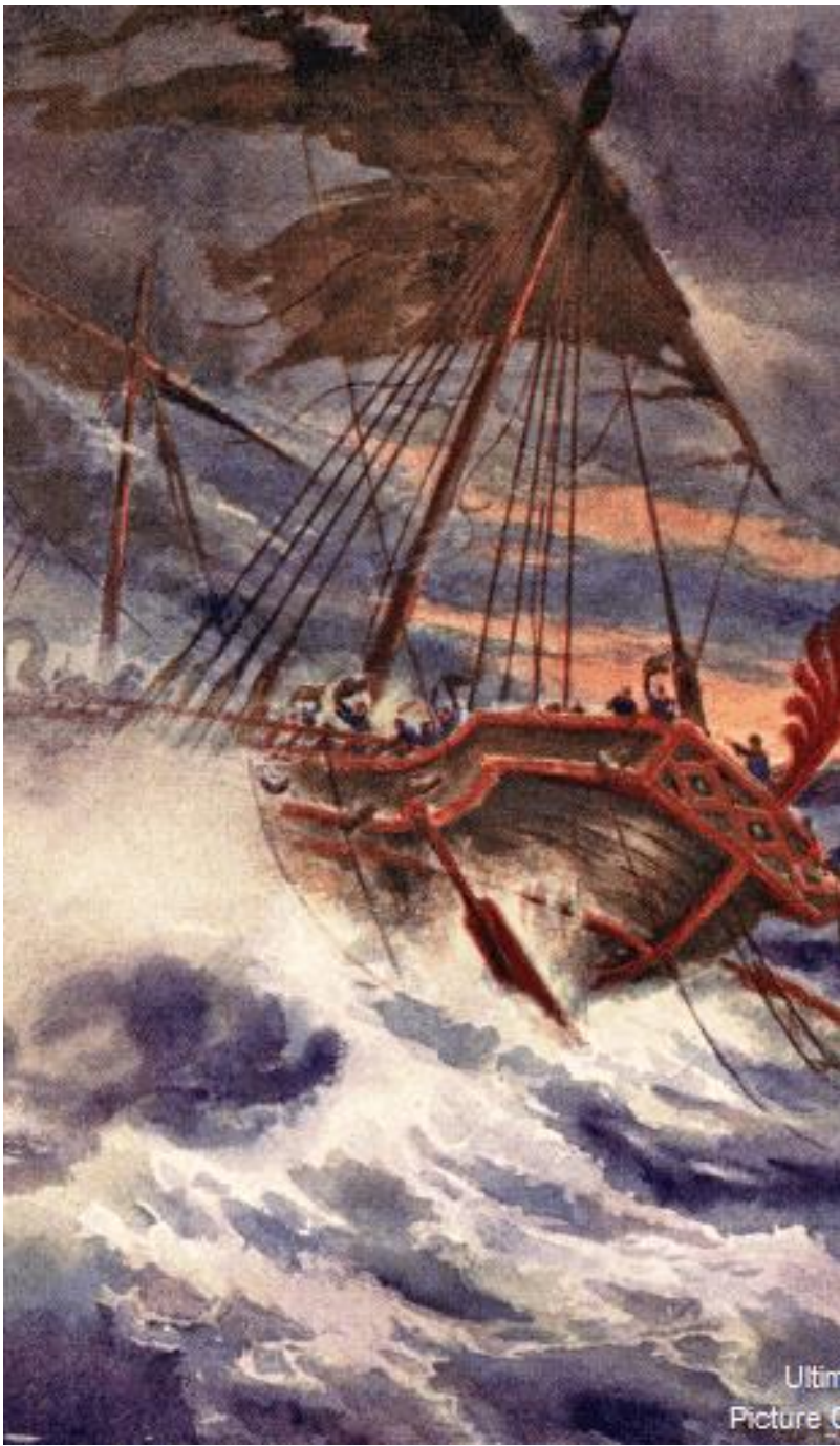
Ultim Picture C